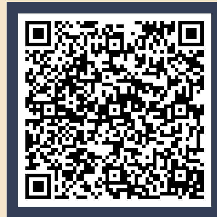
Freshers Fair registration form