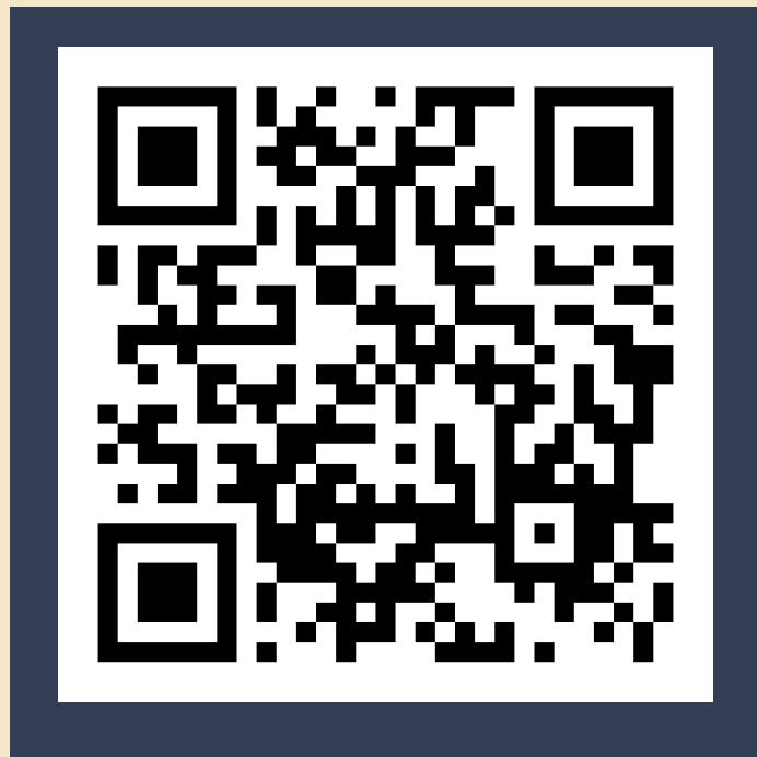
Give it A Go Form