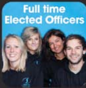
Full time Elected Officers

Can you join the full time officers 2011/12 to make important decisions and run campaigns on behalf of the entire BU student body (18,000 students)?